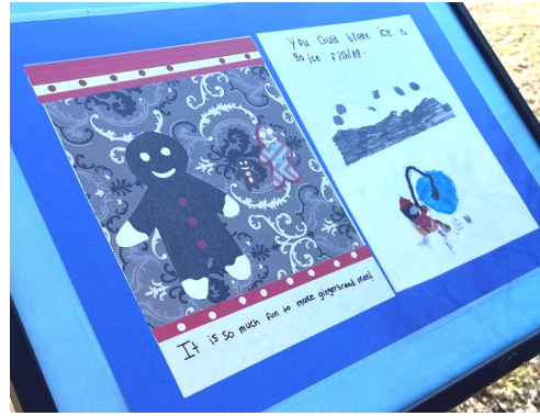
A panel from Hello Winter, a book created for the Franklinville StoryWalk by students.

The project was the brainchild of Franklinville