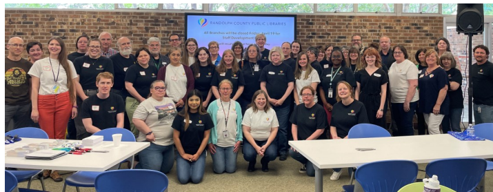
Countywide library staff at last year's Staff Development Day. This year's event will take place on Friday, February 21.

In between, staff met with their strategic planning implementation groups; got refreshers on Reference techniques;